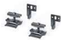
1 PAIR FIXING KIT (SUITABLE FOR COLOUR F28 - SHINY TRANSPARENT)