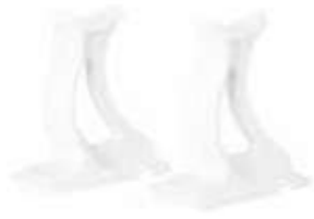
PAIR OF CAST-IRON FLOOR SUPPORTS.