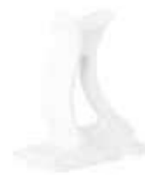
Single cast-iron floor support COLOUR WHITE.