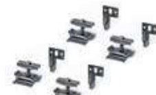
2 PAIRS FIXING KIT (SUITABLE FOR COLOUR F28 - SHINY TRANSPARENT)